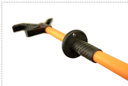
Hand Guard with Tethering Point

Passed third-party high voltage ASTM F3121 Section 6.3 75 kV/ft. 60Hz test