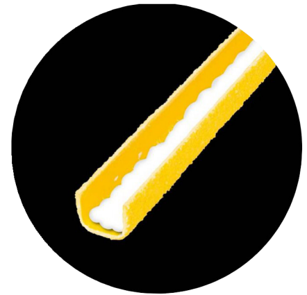
FRP Square Rung Cover