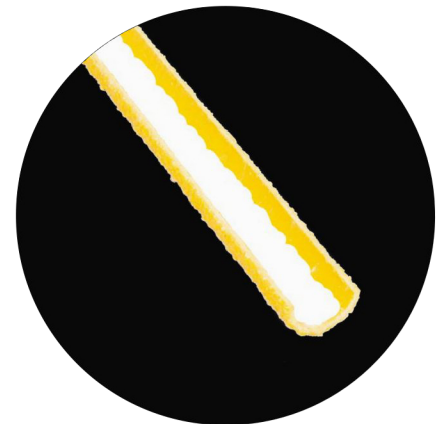
FRP Half Round Rung Cover